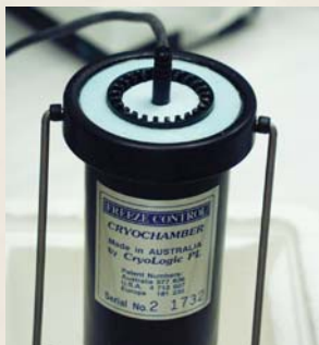
Figure 3 - Cryochamber, Top View

We loaded three micro-glass cryostraws per treatment with approximately 5 \mu\text{L} of diluted semen, and sealed the micro-glass cryostraws with Critoseal. Inserting the micro-glass cryostraws into 500- \mu\text{L} Cassou straws, we placed them in a water bath and cooled the semen-diluent mixture from room temperature to 5 °C over a two-hour period to allow the cryoprotectants to equilibrate. After equilibration, the freezing experiment followed a 2 x 2 factorial design using two diluents for freezing at slow and fast rates. For the slow freezing scheme, we loaded the cryostraws into a Freeze Control Cryochamber (CryoLogic PL, Australia) to cool the samples from 5 °C to -40 °C at 3 °C/min as Harbo (1983) described. The cryochamber is shown in Figure 3. When the samples reached -40 °C, we removed the cryostraws from the programmable freezer and plunged them immediately into liquid nitrogen.