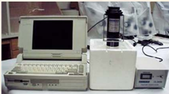
Figure 2 - Programmable Freezing Equipment

We loaded three micro-glass cryostraws per treatment with approximately 5 \mu\text{L} of diluted semen, and sealed the micro-glass cryostraws with Critoseal. Inserting the micro-glass cryostraws into 500- \mu\text{L} Cassou straws, we placed them in a water bath and cooled the semen-diluent mixture from room temperature to 5 °C over a two-hour period to allow the cryoprotectants to equilibrate. After equilibration, the freezing experiment followed a 2 x 2 factorial design using two diluents for freezing at slow and fast rates. For the slow freezing scheme, we loaded the cryostraws into a Freeze Control Cryochamber (CryoLogic PL, Australia) to cool the samples from 5 °C to -40 °C at 3 °C/min as Harbo (1983) described. The cryochamber is shown in Figure 3. When the samples reached -40 °C, we removed the cryostraws from the programmable freezer and plunged them immediately into liquid nitrogen.